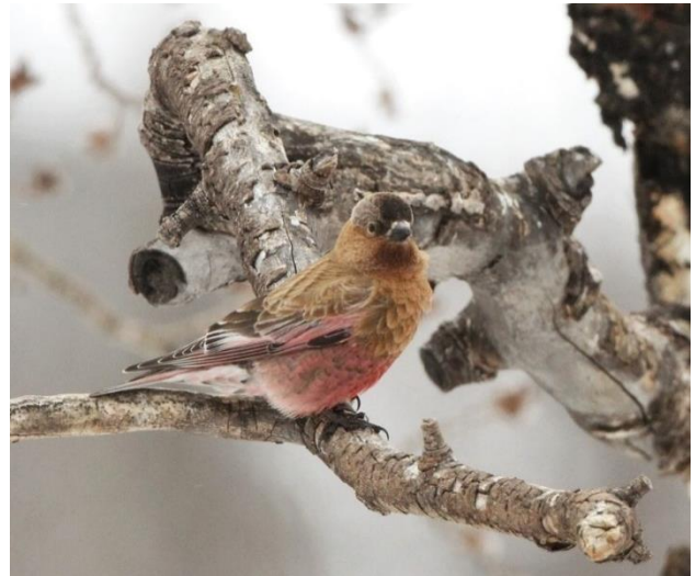
Brown-capped Rosy-Finch

April 7, Day 5: Grand Junction to Craig. In the morning, we will explore the red rock canyonlands of Colorado National Monument searching for Pinyon Jays, Juniper Titmouse and Black-throated Sparrows among the junipers and pinyon pines of this beautiful, stark landscape. While challenging to find on a single morning, we will also be in the realm of the introduced Chukar. Perhaps we'll have some luck with this grouse.