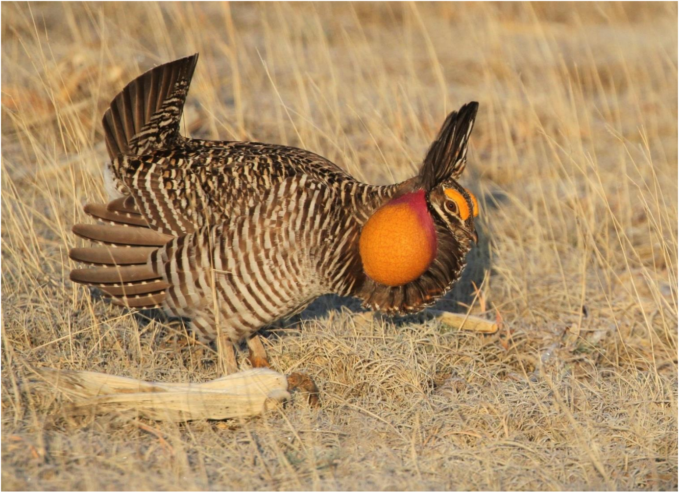
Greater Prairie-Chicken in display

April 12, Day 10: Scott City to Denver. Our final early morning will find us on a Lesser Prairie-Chicken lek. While they look similar when not displaying, the calls are different. More gurgling pops and the smaller brick red air sacs distinguish the Lesser from the Greater. After this last dance we will make our way back to Denver, searching along the way for any missing prairie birds like Mountain Plover, Burrowing Owl, and longspurs. We will have our final group dinner and checklist session at the hotel.