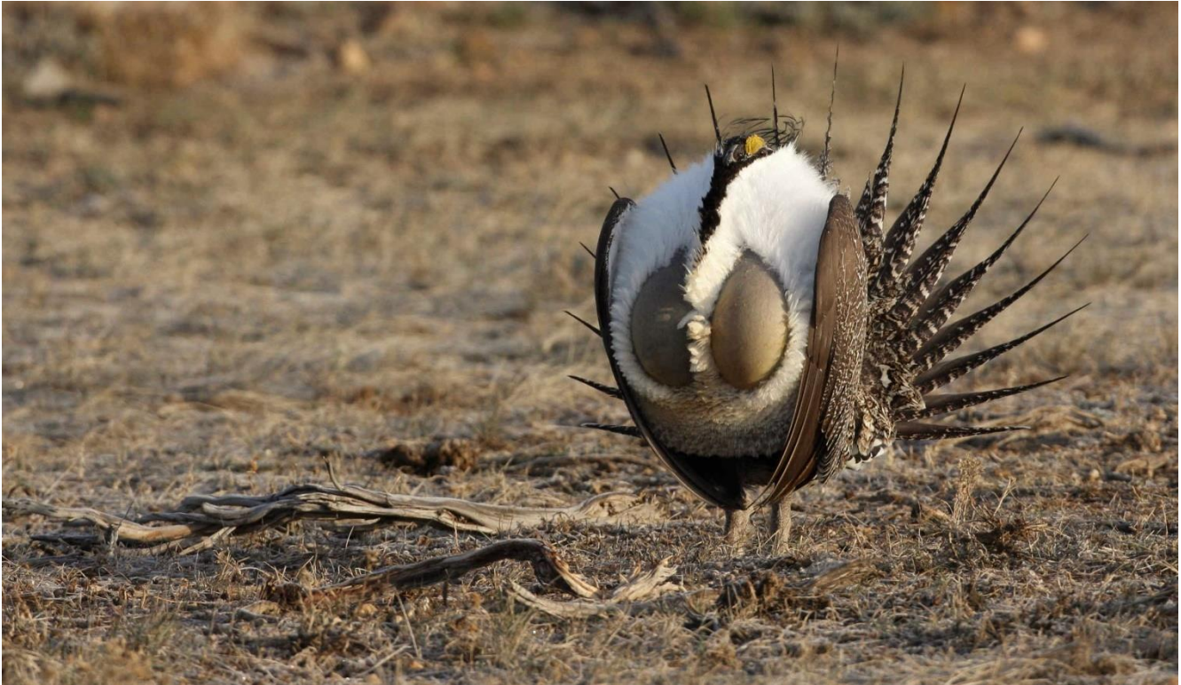
Greater Sage-Grouse display

April 9, Day 7: Walden to Fort Collins. Today we will travel from Walden to Fort Collins, but only after we have watched, the spectacular Greater Sage-Grouse on their lek. We will also spend time searching through the piles of birds at Walden Reservoir; fifteen species of ducks are possible. The grebes, shorebirds and local Bald Eagles will keep us busy for a couple of hours. We'll spend any available time searching for other birds in the foothills, including various raptors, Sandhill Cranes, Green-tailed and Spotted towhees, and Vesper Sparrows. Cameron Pass will afford a final chance for any boreal forest birds we've not tracked down yet. Pine Grosbeak, Cassin's Finch, Canada Jay, and American Three-toed Woodpeckers are all possibilities if we have good weather.